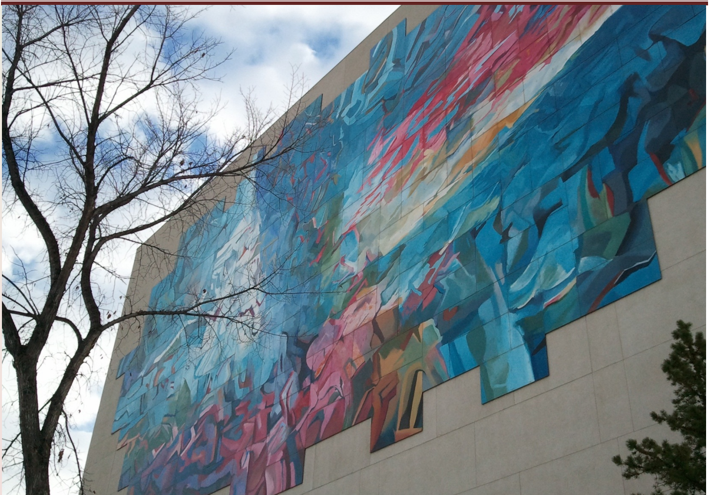
North Tower, Faculty of Education, University of Alberta.